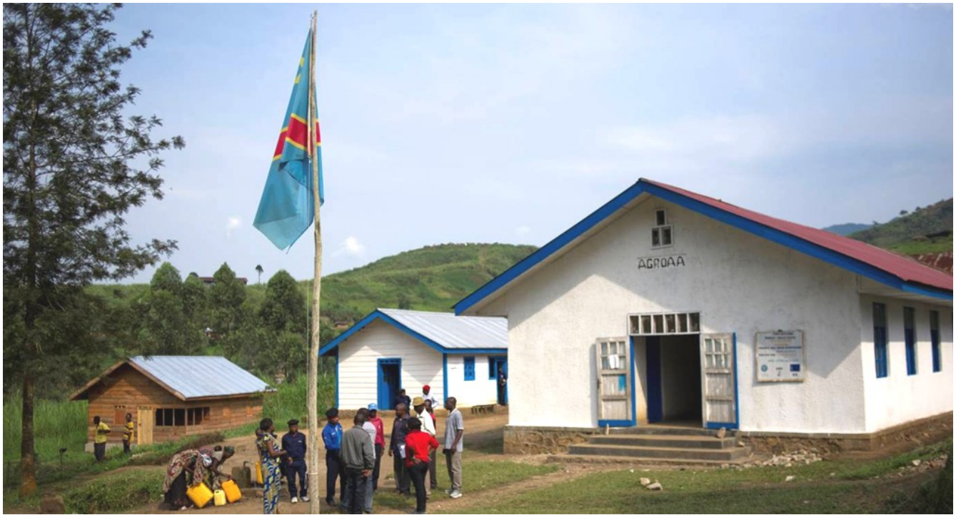
Local government office, Nyabiondo, Masisi territory, North Kivu.